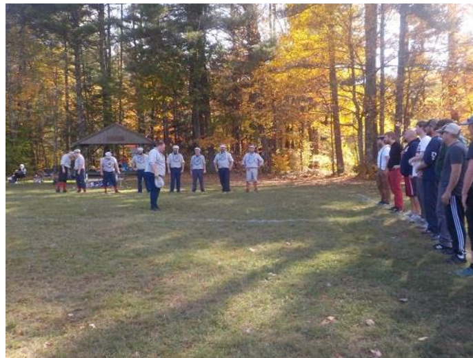
The two teams after nine innings.

They played nine innings. No one kept score but all the players and approving crowd enjoyed the game and the day. It was a fun time for all.