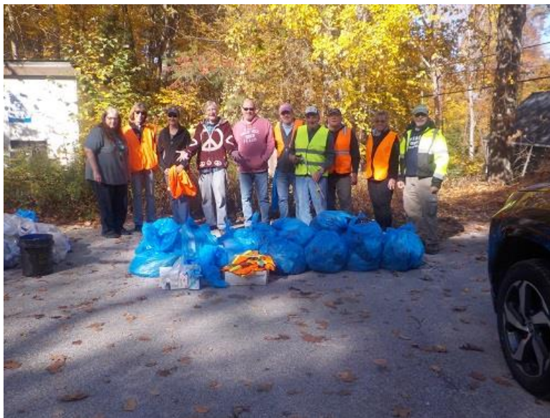
PLIA with their morning pick-up

On Sunday, October 16, 2022, at 9:30 AM members of the Pawtuckaway Lake Improvement Association ( PLIA ) gathered to clean up its adopted section NH Route 156. They found a great deal of trash along the highway. They collected and separated two types of roadside materials- trash and recyclables. Thanks to them for improving the road.