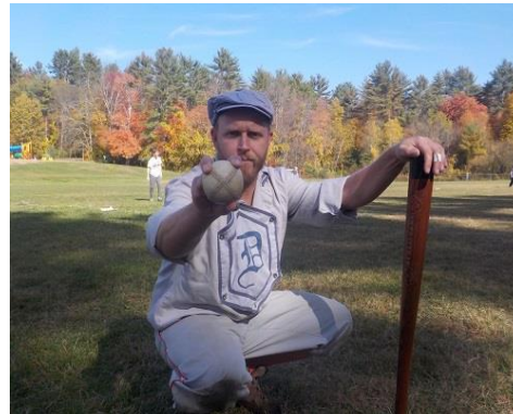
A Dirigo player showing an 1864 style baseball