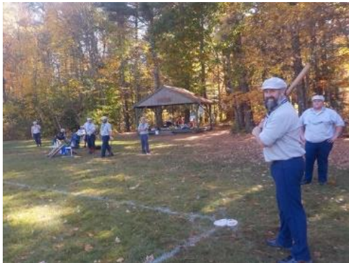
A Dirigo batter at the plate

This was part of the 300 th Committee’s yearlong celebration of the town’s anniversary. It was played using 1860’s equipment and followed 1864 rules. That meant no baseball gloves, a softer leather baseball than now used in Major League Baseball, pitching underhand, only calling balls -three and three strikes when invoked, catching the ball on the first bounce was an out and the pitcher threw from a square. There was no pitcher’s mound at that time.