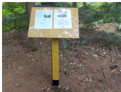
A chapter in the trail tale book.