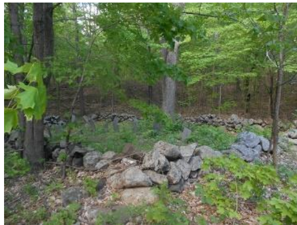
The Goodrich burial ground.

Paula Casey Wood wrote this book after visits to Pawtuckaway State Park. There, she was inspired by seeing the Goodrich burial ground off Tower Road near one of the trails to South Pawtuckaway Mountain.