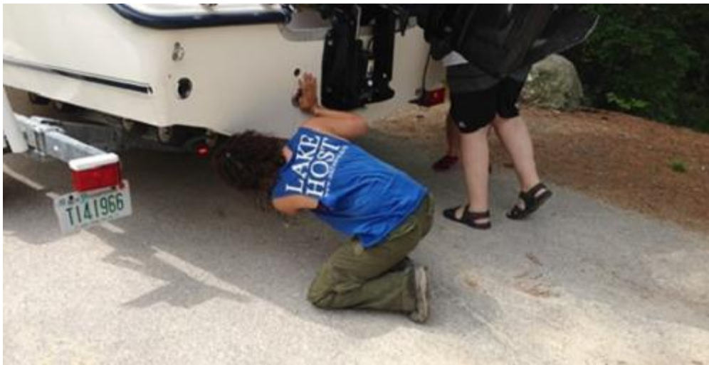
Lake Host inspecting a motor boat invasive species.

Because Pawtuckaway Lake does have Milfoil, the job of Lake Hosts is more important than ever to both prevent boats from bringing it into the lake and also now stop vessels from taking it out. Currently, Pawtuckaway Lake is classified as at risk for Milfoil' and is not fully infested with Milfoil. She asked the BOS for $4,500 for the Lake Host Program of which $3,500 to be provided immediately.