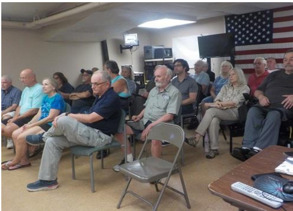
The residents at the BOS meeting on 7/25/2022