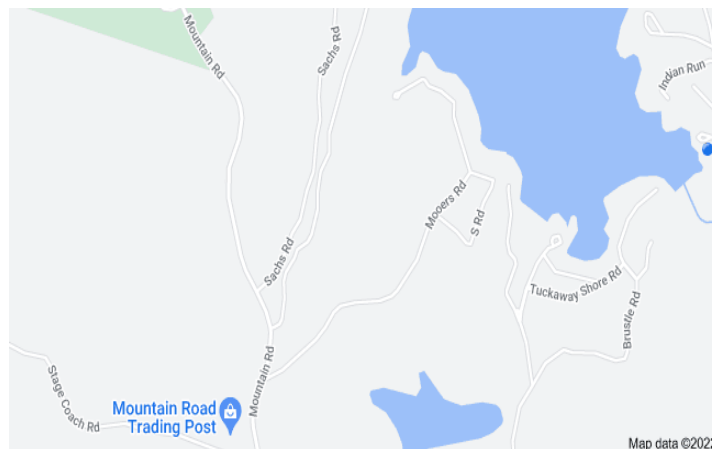
The Mooers Road area