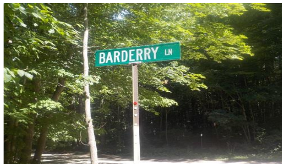
One the roads where there will be E911 changes