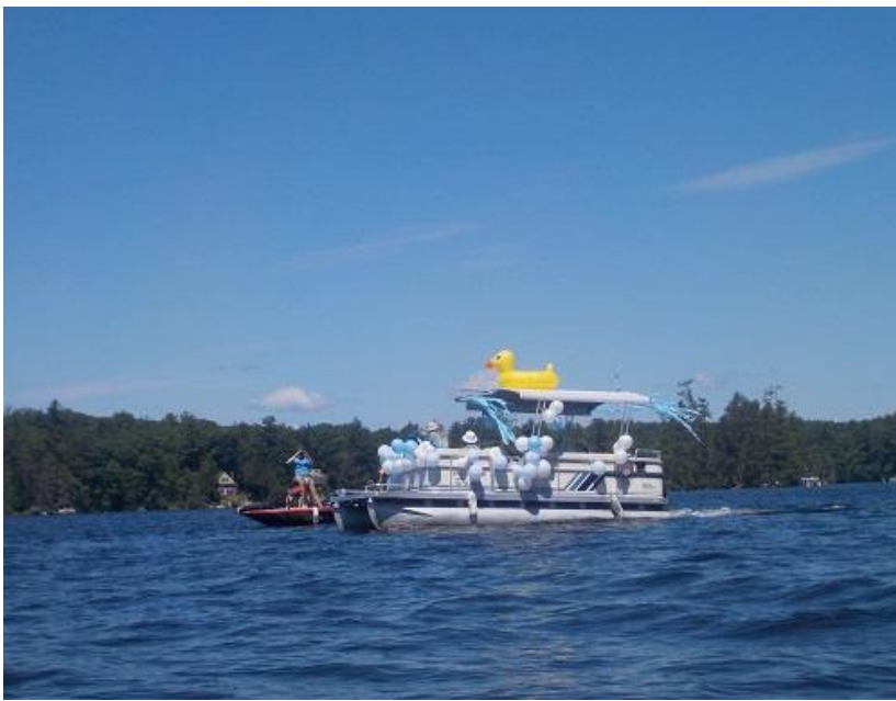
One of the many decorated boats in the 4 th July Boat Parade

Meanwhile, on Pawtuckaway Lake, boats began to assemble at the Twin Islands in the North section of that lake. They were there for the Pawtuckaway Lake Improvement Association's (PLIA) annual July 4 th boat parade . “Every year, to celebrate Independence Day, the PLIA organizes a boat parade around Pawtuckaway Lake on July 4 th . People decorate all kinds of boats—from pontoons to kayaks to power boats to jet skis—with patriotic or fanciful themes, and congregate at the north end of the lake for our annual parade. Residents and vacationers turn out on their docks, rafts, beaches, and decks to cheer and wave as the boats pass by.”