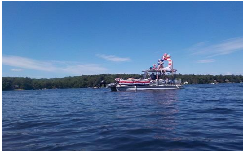
Very colorful and patriotic.

There were many colorfully decorated vessels in parade. Here are three more examples.