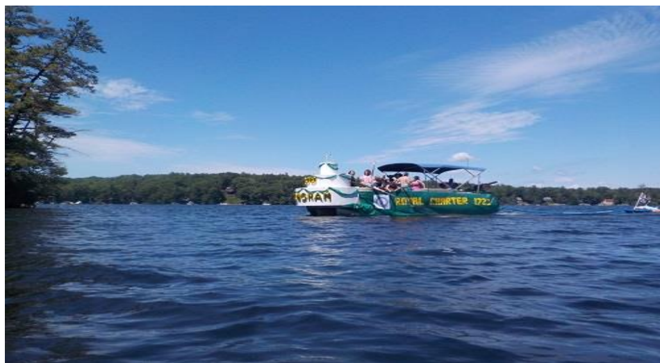
Royal Charter 1722 celebrating the Nottingham's 300 th Anniversary

After assembling at 10 AM, the flotilla started off heading south on North Lake. Along the route, boaters waved to folks gathered on the shore, moored boats and docks, engaged in super-soaker skirmishes, and played music. They motored through South Channel, circled clockwise the South Lake, and completed the circuit just off the Pawtuckaway State Park beach. They not only celebrated the 4 th but also Nottingham's 300 th anniversary, as this boat shows.