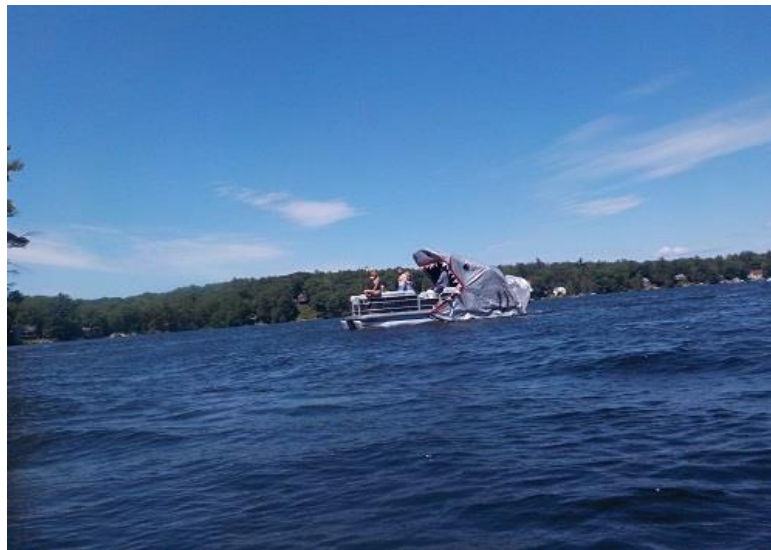
Eaten by jaws!