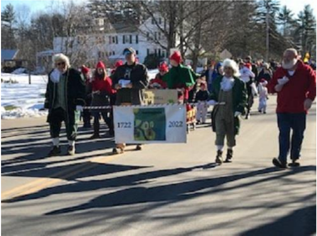
The 2018 Holiday Parade