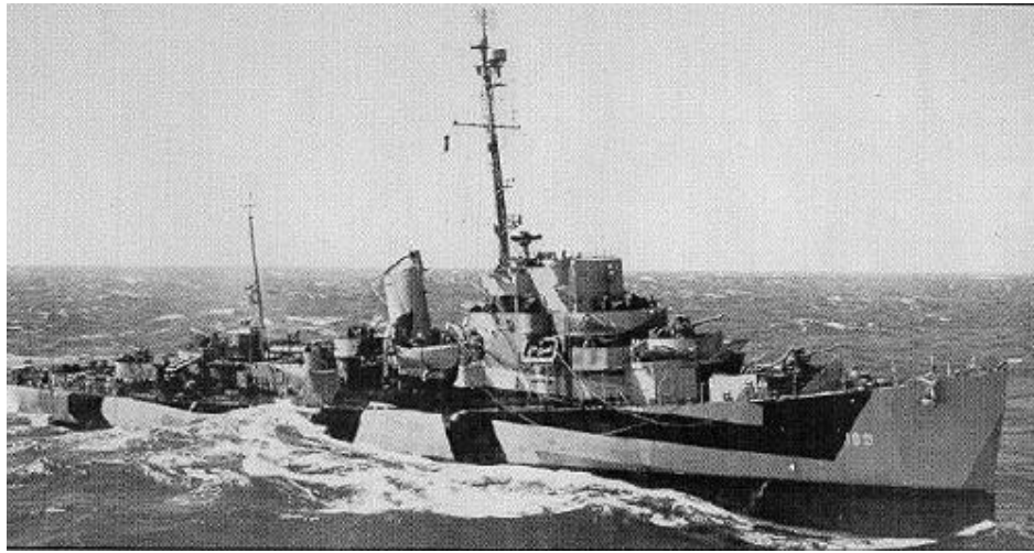
USS Bronstein DE 189