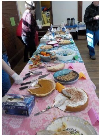
The Nottingham Historical Society's Pie Social, 2019, in the Old Town Hall. The next Pie Social is planned for Sunday, April 23, 2023

The ITA introduced a procedure for use of the Old Town Hall. In the past, the Library for its book sale and the Historical Society for its Pie Social had utilized the Old Town Hall. The BOS agreed to a system of working through its TA on an application procedure for use the Old Town Hall.