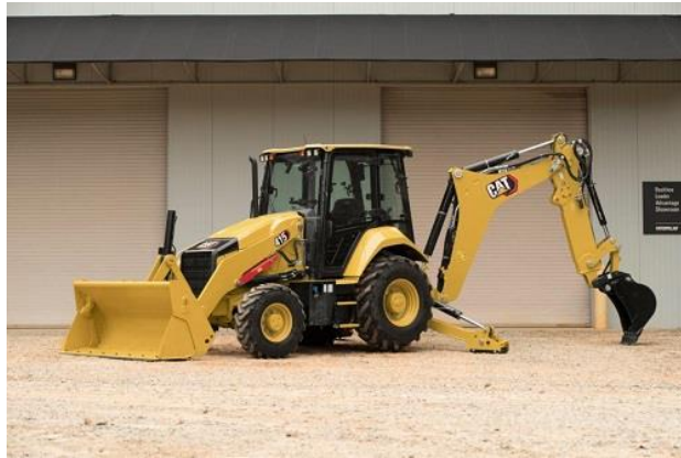
The type of Caterpillar backhoe planned for Recycling Center