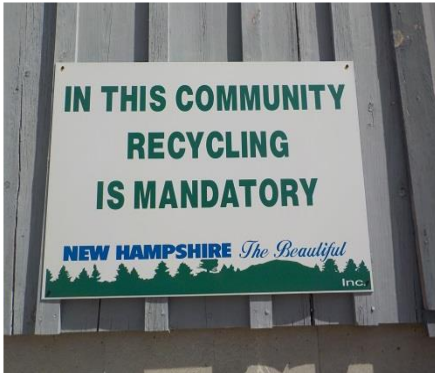
Sign at the Nottingham Recycling Center