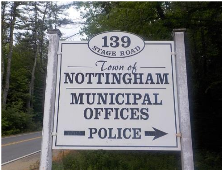
The sign on Stage Road

Nottingham Board of Selectmen Meeting February 27, 2023