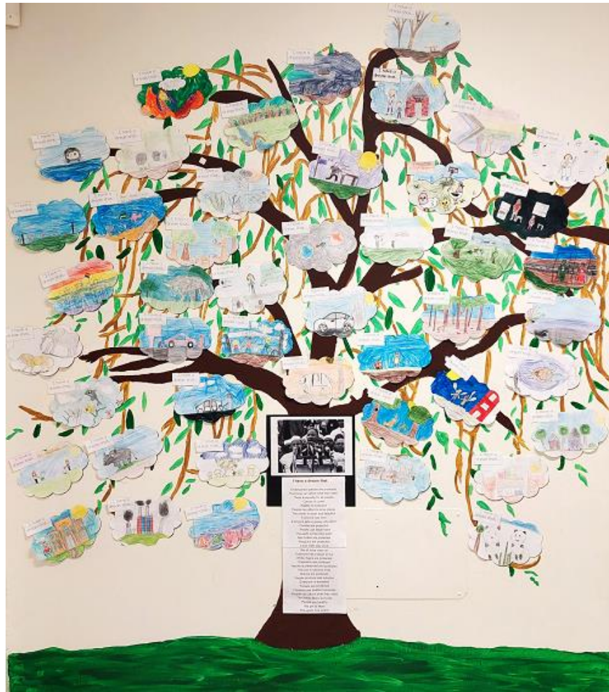
Nottingham School Grade 5, "I Have A Dream" Tree

Nottingham School 5 th Graders Honor Martin Luther King, Jr and the Day