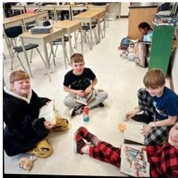
The fifth graders are learning about Martin Luther King, Jr and working on messages for the tree.