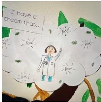
Some of the Fifth Graders' messages,