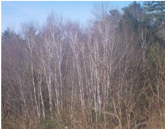
The white paper birches with red leaf buds.

Here is another sign of Spring. The white paper birches are displaying their red leaf buds.