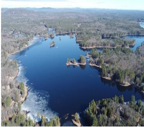
South Pawtuckaway Lake Sunday March 20, 2022

It has been said, New England has three seasons, winter, summer and mud. Mud season has been declared by Nottingham this way, “ Weight Limit on Town Roads . Effective Monday March 7 2022. Nottingham Class V town roads will be posted with a weight limit effective Monday, March 7, 2022. Vehicles with a gross vehicle weight of over 26,000 lbs. will be prohibited from these roads until further notice”.