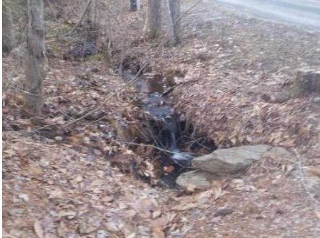
A stream flowing Dolloff Dam Road March 21, 2022

Here is another sign of Spring. The white paper birches are displaying their red leaf buds.